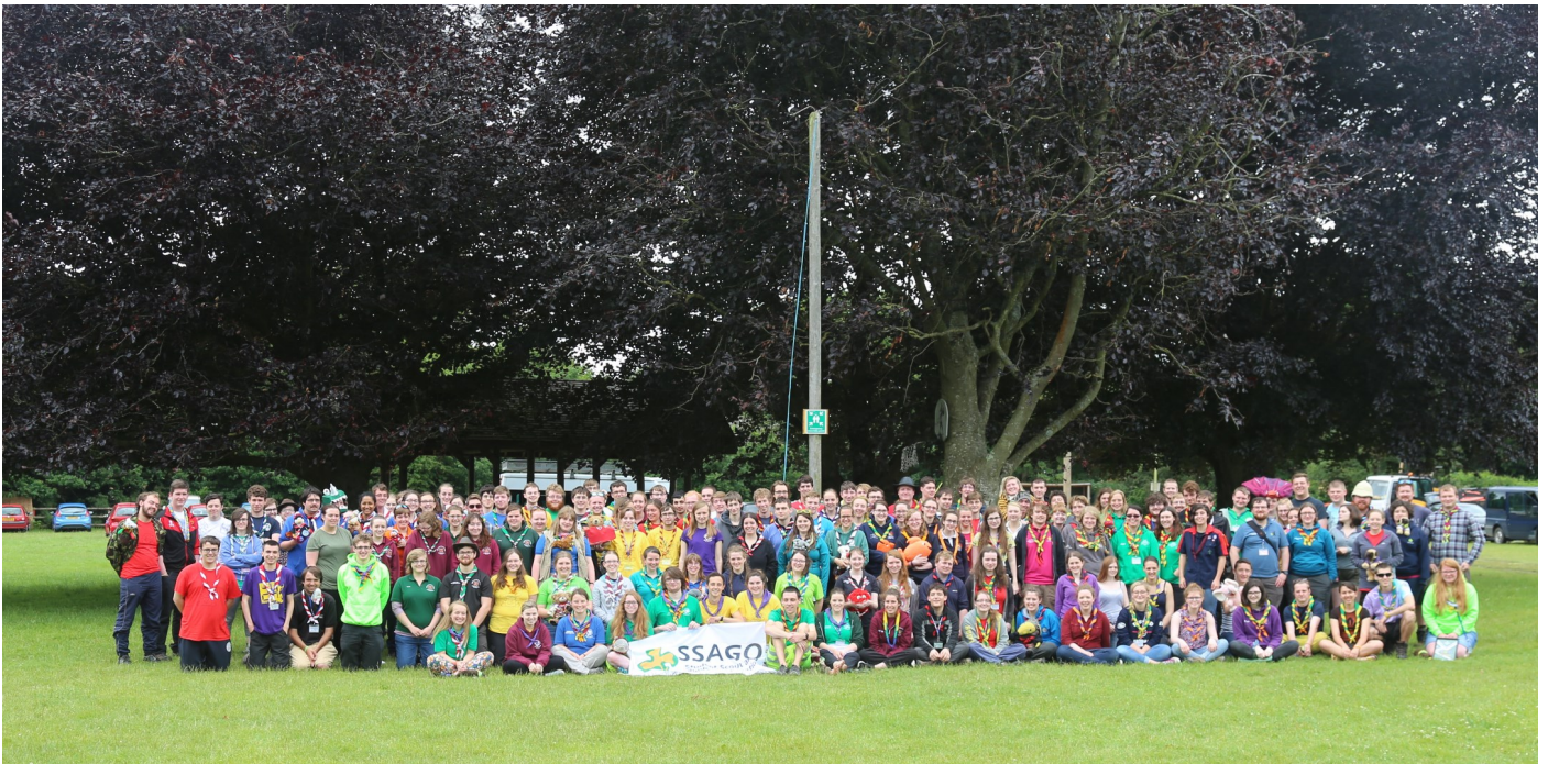
Southampton Dino Rally

News is just coming in that a meteorite collided with Butchers Coppice, Earth at approximately 12:00pm on Sunday. Reports seem to suggest there are no dinosaur survivors. However some SSAGO members were able to escape on a space ship and are heading to a central location in Outer Space!