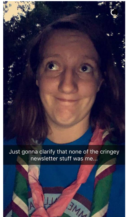
Just gonna clarify that none of the cringey newsletter stuff was me...